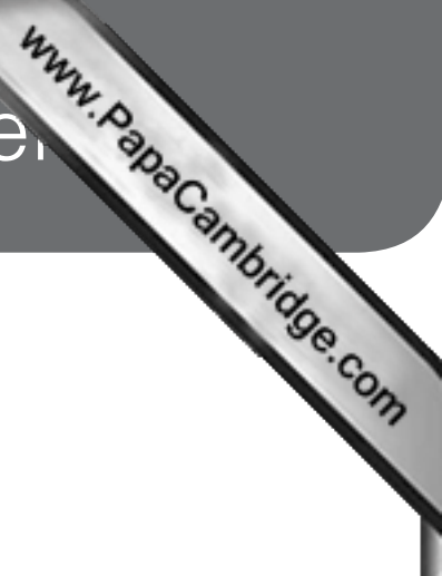
Table C – Mark Scheme for Impression (10 marks)

A mark out of 10 is awarded for Impression.